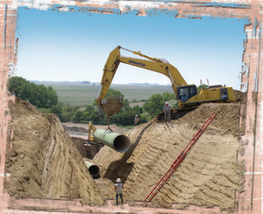
pipe on the crest of a bluff west of Vermillion, St

Another 13.8 miles of pipeline contracts have been awarded (see front page story). With the completion of these projects, approximately 46% of the pipeline connecting the well field to the Sioux Falls service connection will be complete. Plans and specifications are being developed for bidding the next 16 miles of 54" pipeline this spring (segment 5), which runs from