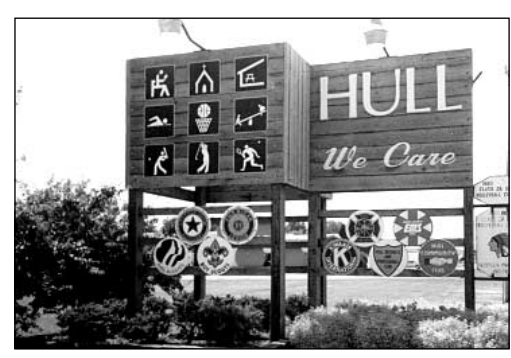
—Hull, Iowa sign on Highway 18