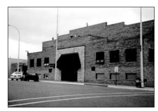
—Hull, Iowa City Hall