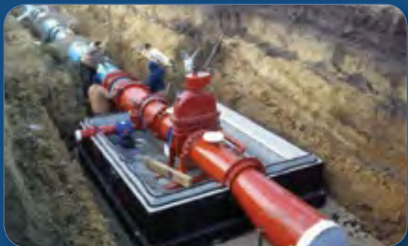
Isolation valve vault

Merryman Excavation is currently pressure testing and disinfecting Minnesota – Segment 1A, which is a six mile stretch of 30 inch PVC pipe on the Iowa side of the Iowa-Minnesota border. The contractor expects to have the work done by mid-April, at which time Rock Rapids will begin receiving Lewis & Clark (L&C) water for the community! Rock Rapids recently completed three miles of pipe to connect with L&C. The