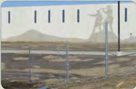
Chain link perimeter fence

Even though Phase 2 (main water treatment plant building) reached substantial completion when the plant began delivering water on July 30, the work was far from complete. Many “punch list” items still need to be completed, including electrical work such as installing lighting and switches, as well as things like installing doors, cabinetry, security systems and painting. These items are needed, but do not impact the delivery of water. Foley Company and their subcontractors are steadily working to finish up and expect to have most of the punch list items completed by mid-April. Some exterior site related items cannot be completed until the weather cooperates.