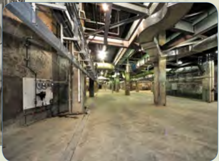
Pipe gallery for the solids contact basins