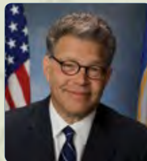
Senator Al Franken