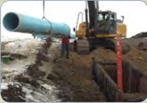
Using a trench box to install 30" PVC pipe