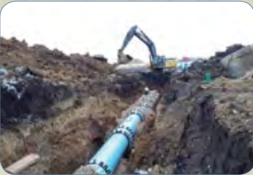
First pipe being constructed in Minnesota!

landowners complimented Merryman on the good job they did restoring the top soil. They still have more soil restoration and clean up to do before reaching final completion.