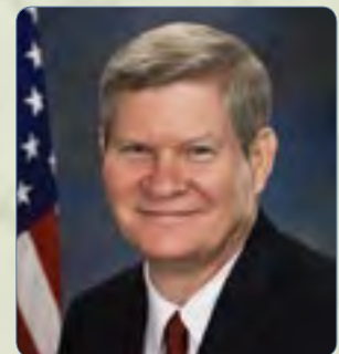
Senator Tim Johnson