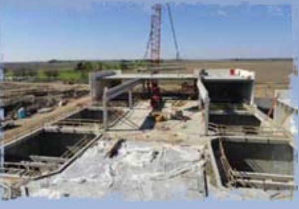
Roof beams going up over the filter area.