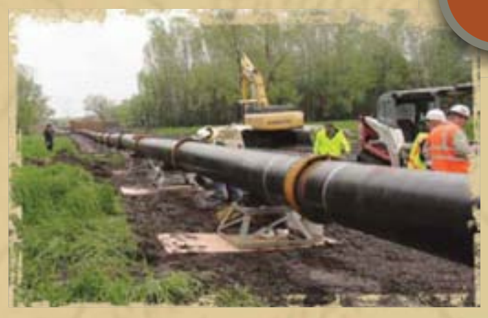
24" ductile iron pipe that was pulled through the directionally drilled bore under the Big Sioux River.

Directionally drilling under the Big Sioux River.