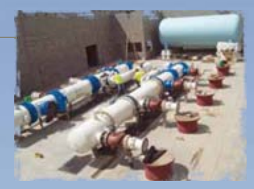
Process piping being installed and painted on the main floor of the pump station, with the surge tank in the background.

The Lewis & Clark Board recently granted Eriksen Construction a 60 day time extension due to delays the contractor has experienced getting the eight 350 h.p. pumps from the manufacturer. November 2011 is the new substantial completion deadline. The engineers do not feel this delay will affect the scheduled delivery of water in the spring of 2012. Eriksen has installed the main floor of the pump station, which covers the lower level pipe gallery. They are installing process piping on the main floor, as well as the piping that connects the pump station with the reservoirs. The surge tank has been set and a lot of electrical work has been completed. Quite a bit of masonry work has also been completed on the walls and roofs.