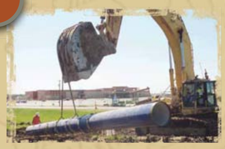
24" pipe being installed on the SD side, with the new casino in the background on the IA side.