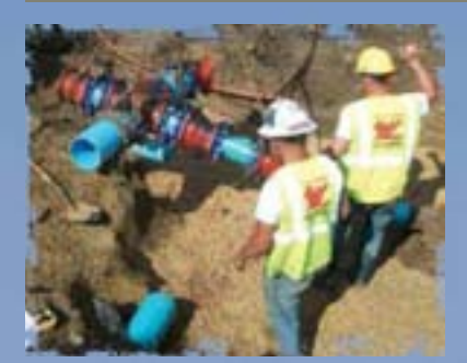
Making the connection with Beresford's infrastructure on TWP-11.

Slowed by wet conditions, Nitteberg Construction finally finished installing the last section of 10" pipe for the 14 mile Parker service line in mid-June. The contractor is in the process of pressure testing and disinfecting this service line, as well as the previously constructed five mile stretch of 6" service line for Centerville. Winter Brothers Underground is finishing clean-up and soil restoration on the one-mile service lines for Lennox and South Lincoln RWS.