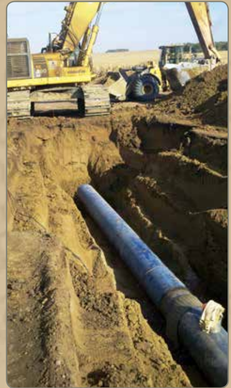
Final section of 36" pipe for MN-1 being installed.