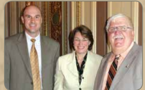
Larson, Senator Amy Klobuchar and Arndt.

percentage of a shrinking amount of overall construction funding. The administration only requested $20.2M for seven rural water projects in FY12 compared to $47.5M in FY11.