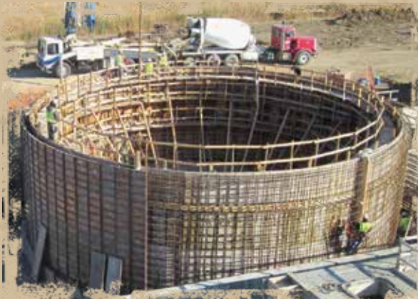
Concrete walls being poured for the gravity thickener.

Final completion was reached in October for Phase 1, which includes the three million gallon underground reservoir, high service pump station, electrical switchgear building and back-up generators. Mid-April is the current substantial completion deadline for Phase 2, which is the main treatment plant building. It is estimated Foley is about one month behind schedule, but they believe they will be able to make up that time in the coming months. Based on that schedule, the Lewis & Clark staff is planning to begin equipment training in December, which will continue pretty much non-stop through March. Five more employees will be hired this winter, for a total of eight operations employees at start-up. When operational, the plant will supply treated water to 11 of the 20 member cities and rural water systems.