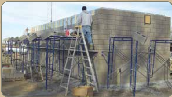
Concrete blocks being placed on the exterior of the Minnehaha Community Water Corp – West meter house.

Hoogendoorn Construction is the contractor for both Meter Building Package 1 and Package 2. Package 1 includes pre-fabricated meter houses for Centerville, Lennox, Minnehaha Community Water Corp – West and South Lincoln RWS, and Package 2 includes built on-site meter houses for Beresford, Parker and Sioux Falls – Benson Road. Hoogendoorn experienced a lengthy delay getting the pre-fabricated meter houses from the factory in Wisconsin, but plans to have all the meter houses completed by January. Exterior concrete block and a roof have been added to the pre-fabricated meter houses.