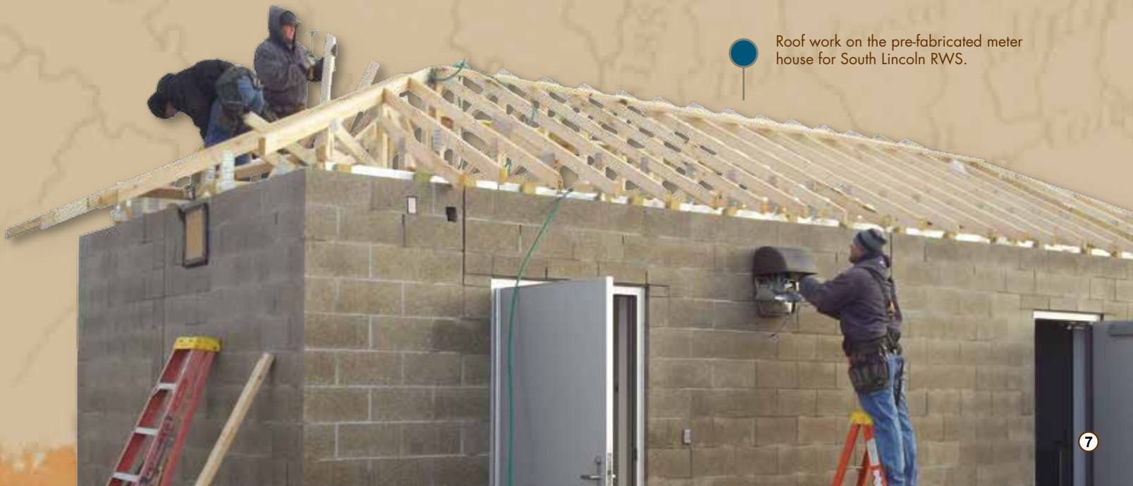
Roof work on the pre-fabricated meter house for South Lincoln RWS.