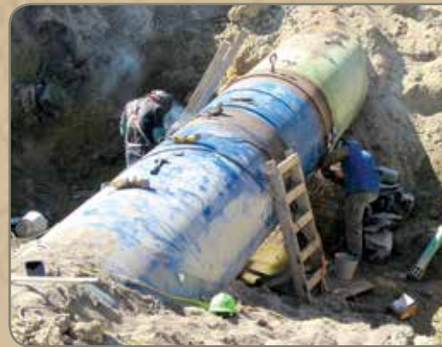
Another "golden spike" – final section connecting the raw water pipeline with the treatment plant piping.