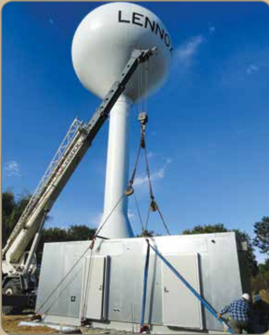
Pre-fabricated meter house being lowered into place near the base of the Lennox water system.