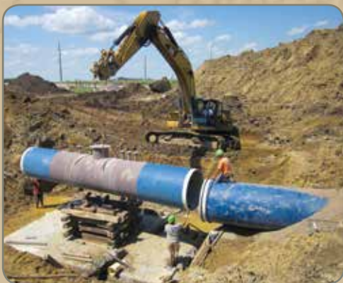
54" section of pipe being installed for an isolation valve vault near the plant.