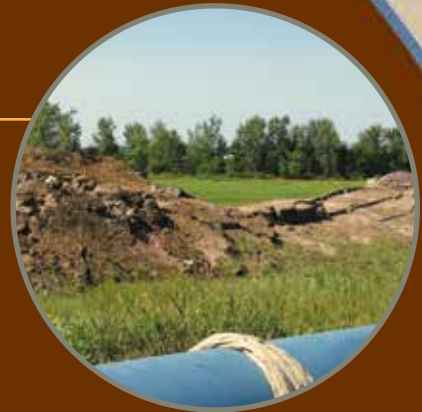
Rock and soil heaved from subsurface dynamite blast.

It took three months longer than projected, but water began flowing on October 5 to Rock Rapids through an eleven mile “emergency connection.” Until the treatment plant is operational, Lewis & Clark (L&C) is purchasing 60,000 gallons of water a day from Lincoln County RWS (LCRWS). In turn, Rock Rapids ultimately is selling the water to the Grand Falls Casino in northwest Iowa. Completion of the 24” pipe for Minnesota – Segment 1 (MN-1) by Morgan Contracting was delayed by wetter than anticipated conditions, difficulties crossing the Big Sioux River and unexpectedly encountering close to 1,000 feet of granite that needed to be blasted. continued page 2