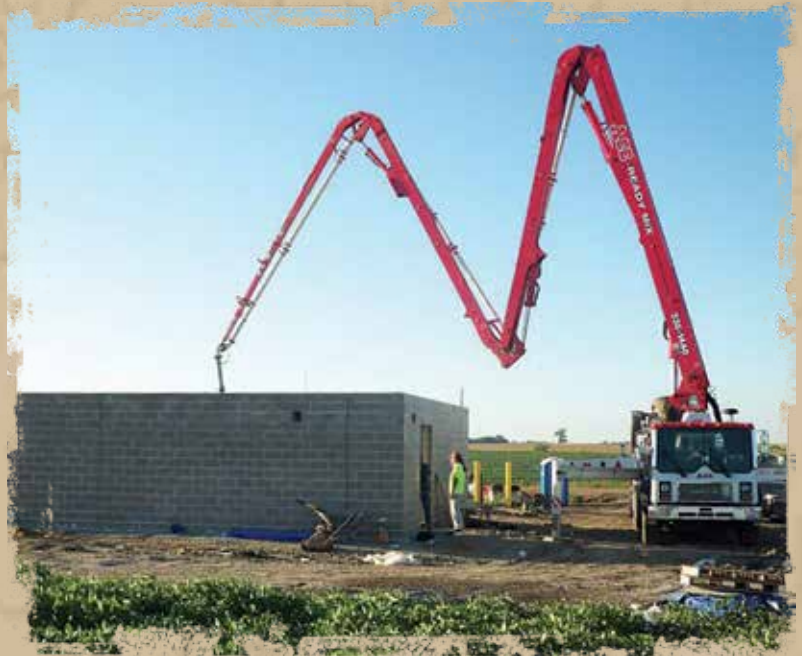
Concrete being poured for the floor of the built on-site meter house for Beresford.

Hoogendoorn Construction is the contractor for both Meter Building Package 1 and Package 2. Package 1 includes pre-fabricated meter houses for Centerville, Lennox, Minnehaha Community Water Corp – West and South Lincoln RWS, and Package 2 includes built on-site meter houses for Beresford, Parker and Sioux Falls – Benson Road. Hoogendoorn experienced a lengthy delay getting the pre-fabricated meter houses from the factory in Wisconsin, but plans to have all the meter houses completed by January. Exterior concrete block and a roof have been added to the pre-fabricated meter houses.