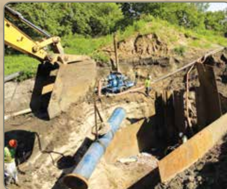
Construction just west of the Big Sioux River.