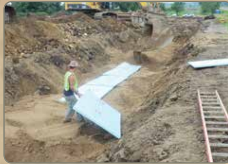
Styrofoam insulation for additional frost protection due to shallower trench.

This is one of two connections for Rock Rapids. The second connection further to the east will provide water to the City. Six miles of 24" pipe still needs to be constructed along the Iowa border for this second connection, which is ready to bid as soon as federal funding is available. From there, the next pipeline segment will head north to Luverne. This segment between the Iowa border and Luverne, which will also connect Rock County RWD, is also ready to bid as soon as federal funding is available.