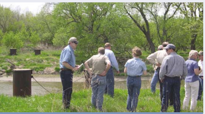
IERT review of the proposed Big Sioux River crossing

with the design and soil boring investigations that will be necessary for the development of plans for the river crossing. The participation of representatives of the lowa State Historical Preservation office made the meeting more