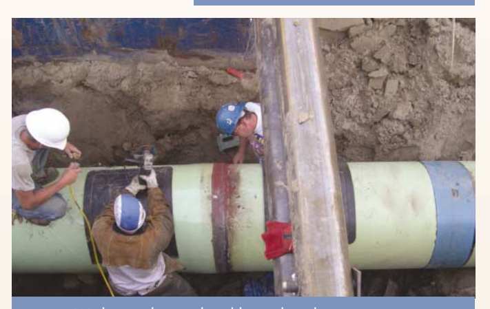
Workers in the trench weld, grind, and inspect a joint. A blue protective sleeve will be placed over the top of the joint. Note the blue sleeve to the right, which was installed as a test.