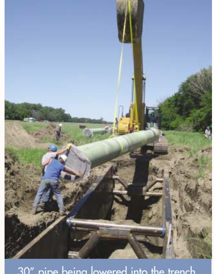
30" pipe being lowered into the trench. A "trench box" is being pulled, which narrows the area needed to be excavated.