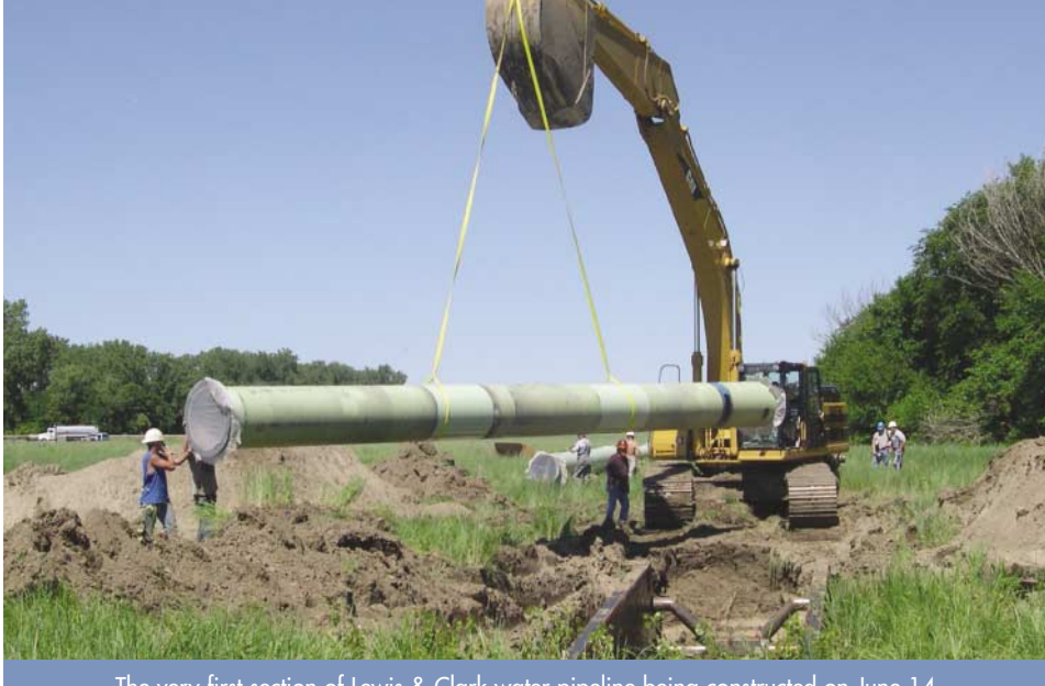
The very first section of Lewis & Clark water pipeline being constructed on June 14 at the Mulberry Point well field, just west of the Vermillion-Newscastle Bridge.

souri River to the northern boundary of the Frost Game Production Area, along Highway 19. The diameter of pipe that will pri-