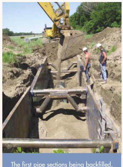
The first pipe sections being backfilled, with the next sections ready to go.