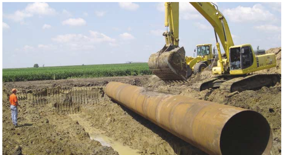
Pipe casing being installed under Highway 19, near Vermillion, SD.

The casing won't be needed for a couple years, but was installed at this time because the highway was in the process of being rebuilt. Putting in the casing now, rather than waiting to bore under the newly paved highway, resulted in a sizeable savings. The 54" raw water pipeline will go through the casing, which leads to the water treatment plant site. A production test well was installed in 2000 and another one is currently being dug, but those activities are considered "exploration," not construction.