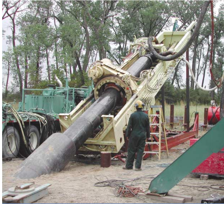
Production test well being drilled at Site D

The drilling crew has encountered coarse material at this depth. The material is the same size as the proposed gravel pack, making it unnecessary to install a gravel pack. This permits the use of a larger diameter screen, which should increase the production capacity of the well by about a half million gallons per day. Production test pumping is scheduled for completion in late October, which will provide a clear indication of the well capacity at this location.