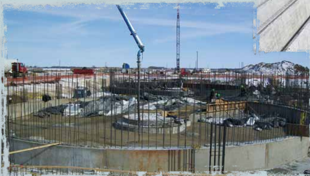
"Flowable fill" (thinner consistency concrete used for filling gaps) being poured in the floor area of one of the solids contact basins.

In addition, the three lime sludge lagoons have been excavated and finish grading and seeding will take place this spring. LRC Contracting of Spicer, MN is the excavation subcontractor.