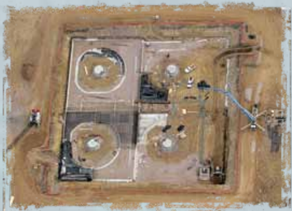
Aerial view of the work on the four solids contact basins.

Foley Construction and their subcontractors have not let winter stop construction, but the heavy snows, freezing rain and bitter cold have certainly slowed the progress being made. Despite the cold and snow, concrete continues to be poured for both phases. In addition to routinely moving snow, a great deal of time is spent heating the ground in preparation for the concrete.