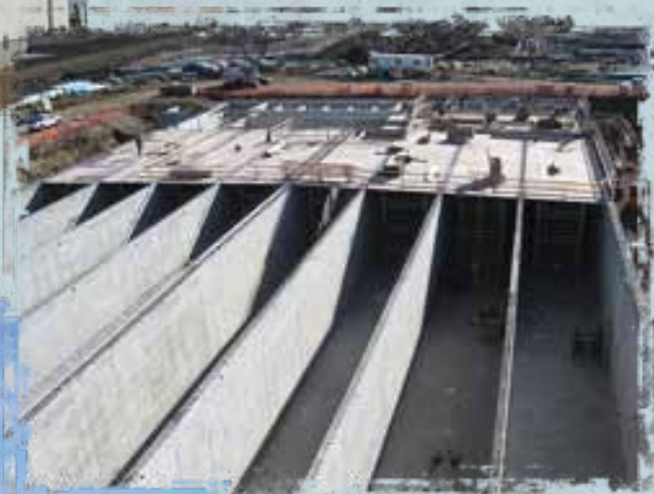
Baffle walls in the clearwell portion of the underground reservoir. This maze of walls ensures the first water into the reservoir is the first water pumped out. The entire reservoir is now covered.