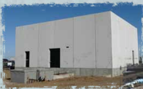
Electrical switchgear building

the electrical switchgear building over a three-day period in late October. The electrical subcontractor, E&I out of Sioux Falls, is busy installing the electrical conduit and switchgear infrastructure in the building.